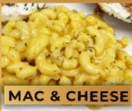
MAC & CHEESE